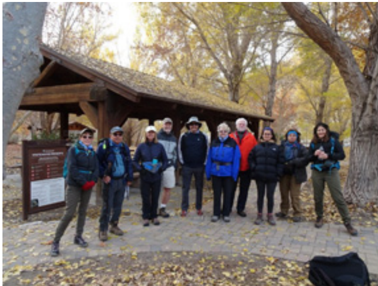
2019 December 30 Whitewater Preserve DSC02424R.jpg Whitewater Preserve Hike, December 30, 2019

Here is some updated information on projects we are following: